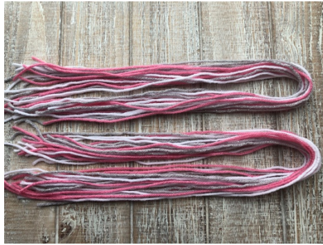
Braided tie example for the infant hat.