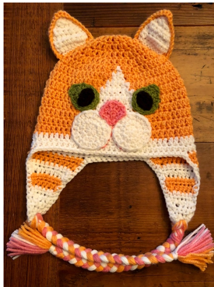
Finished braided tie example for the older child/adult hat.